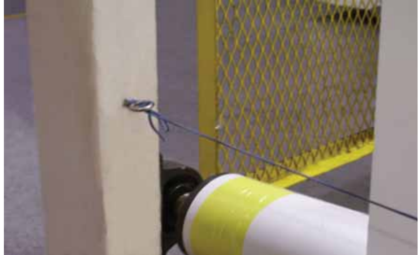
Installation of Stop Static string at Adchem's facility in Riverhead, N.Y., for static control efficiency testing.

The static level was measured in a free space (an ample distance from any rollers) 10 minutes after the start of a production run. Precise measurement of the static charge over a free-span web surface was performed with a hand-held