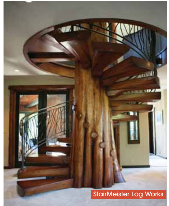
StairMeister Log Works

StairMeister Log Works, LLC of Boulder, Colo., has been creating handcrafted stairs since 1992. The company recently created the