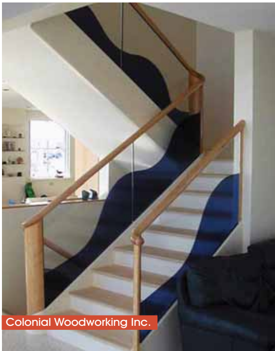
Colonial Woodworking Inc.