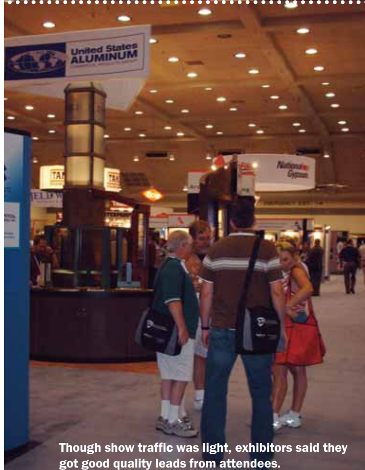
Though show traffic was light, exhibitors said they got good quality leads from attendees.