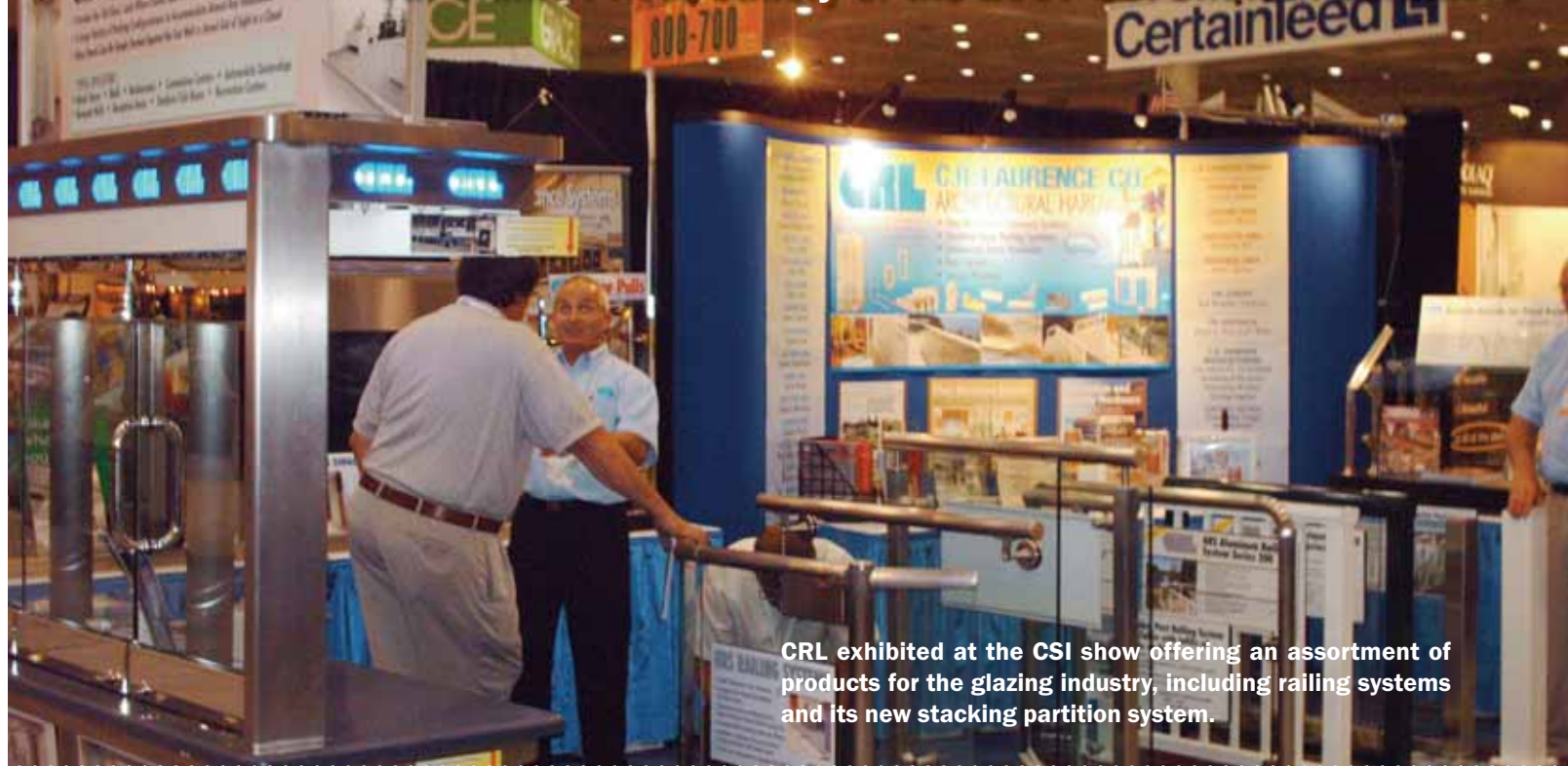
CRL exhibited at the CSI show offering an assortment of products for the glazing industry, including railing systems and its new stacking partition system.

An Online Photo Gallery of the 2007 CSI Show in Baltimore