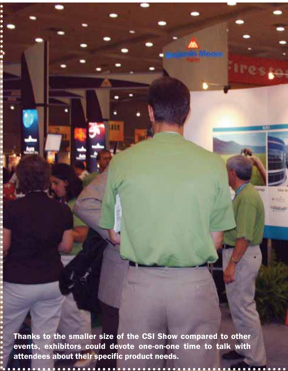
Thanks to the smaller size of the CSI Show compared to other events, exhibitors could devote one-on-one time to talk with attendees about their specific product needs.